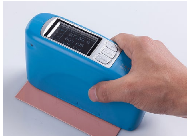
Gloss meter with three angles: 20°/60°/85°.