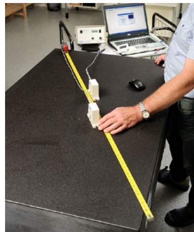
Calibration of surface plates.

These are calibrated with one of our developed methods.