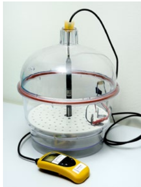
Calibration of hygrometer.

Hygrometers are calibrated in our laboratory, whilst climate chambers most often are calibrated in the field for practical reasons.