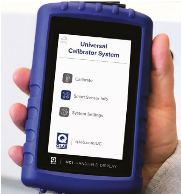
Universal Calibrator (UC) System for calibrating irradiance and temperature in QUV and Q-SUN Weathering Test Chambers.

We offer calibration and service of Q-Lab's equipment for weathering, light stability, and corrosion for customers in Sweden, Norway and Denmark.