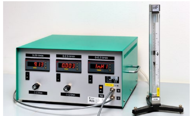
Calibration of flow meter with float.